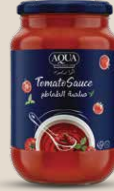
صلصة الطماطم TOMATO SAUCE