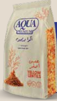
عدس اصفر YELLOW LENTILS