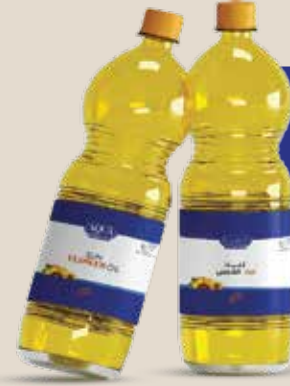
زيت عباد الشمس SUNFLOWER OIL