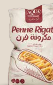
مكرونه فرن PENNE RIGATE