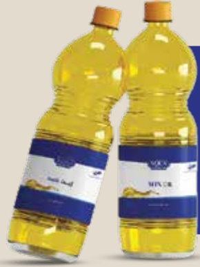
زيت خليط MIX OIL