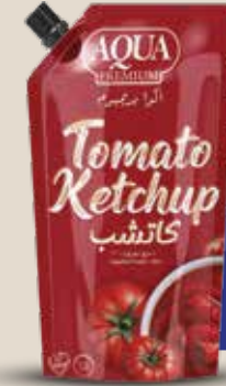
صلصة الكاتشب KETCHUP SAUCE