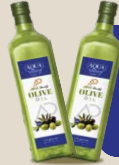
زيت الزيتون OLIVE OIL