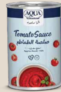
صلصة الطماطم TOMATO SAUCE