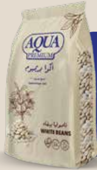
فاصوليا بيضاء WHITE BEANS