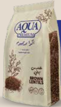
عدس بني BROWN LENTILS