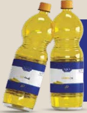
زيت الذرة CORN OIL