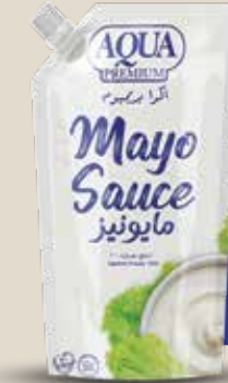
صلصة المايونيز MAYO SAUCE