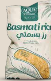
ارز بسمتي BASMATI RICE