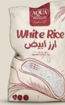
ارز ابيض WHITE RICE